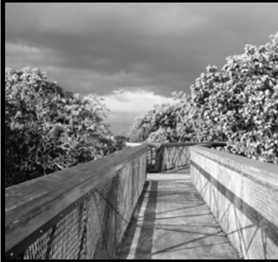
Treetop Walkway at Kew Gardens

CiCi's month is based on her work with the moving body as the smallest architectural unit in the built & natural environment. Her program explores movement within private and public space - how do we inhabit these different realms, and could our private choreographies expand into and directly shape the design of public space?