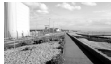
Portslade Seafont

CiCi will lead an intensive movement exploration of Portslade's unique, densely layered public spaces, and of the private choreographies that shape them. How do we experience these diverse urban environments, from working harbour & commercial wastelands, via semi-industrial streets & residential neighbourhoods, to the edge of the downs. From watching ships on the horizon to stalking deer on the hills.